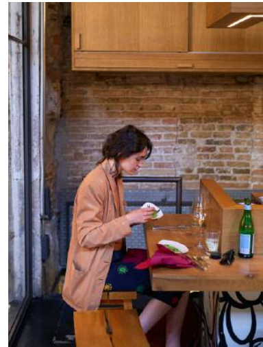
04_