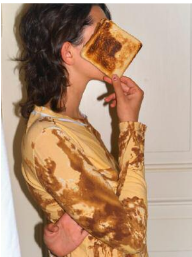
11_