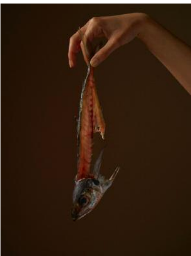
05_