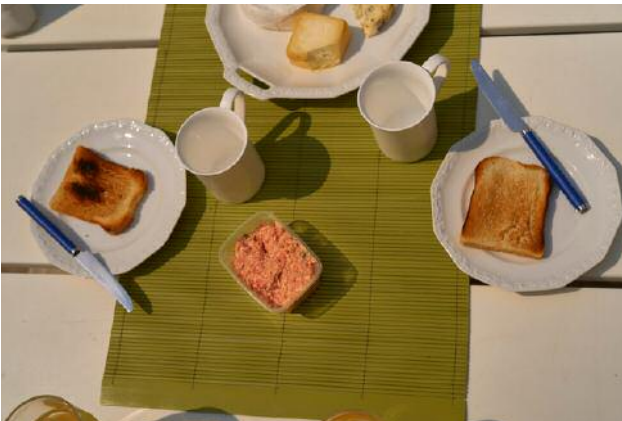
03_