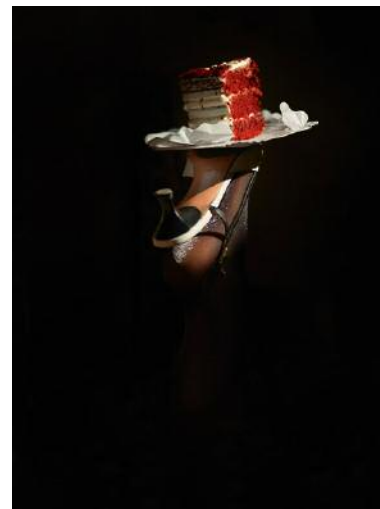
12_