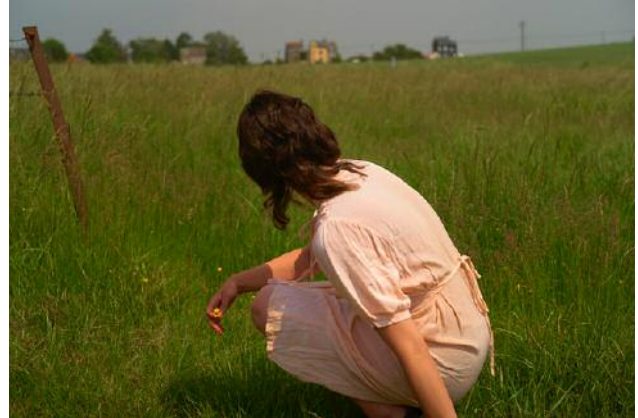
02_