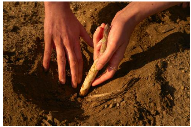
08_