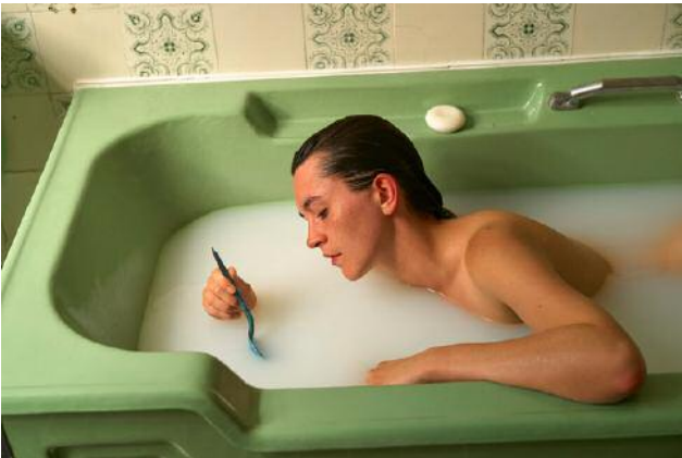
09_