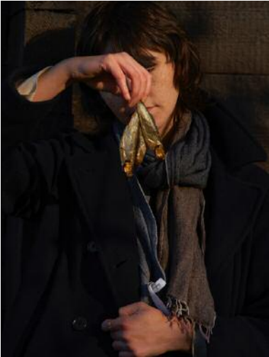
01_