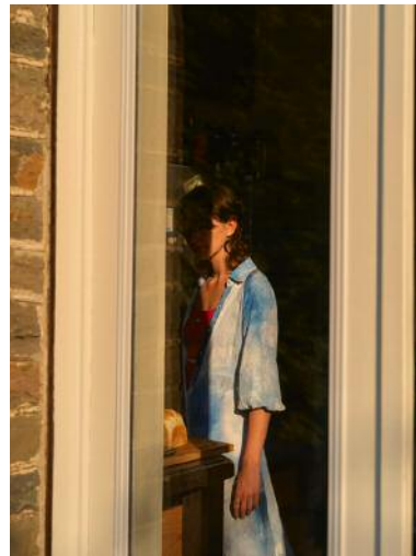
10_