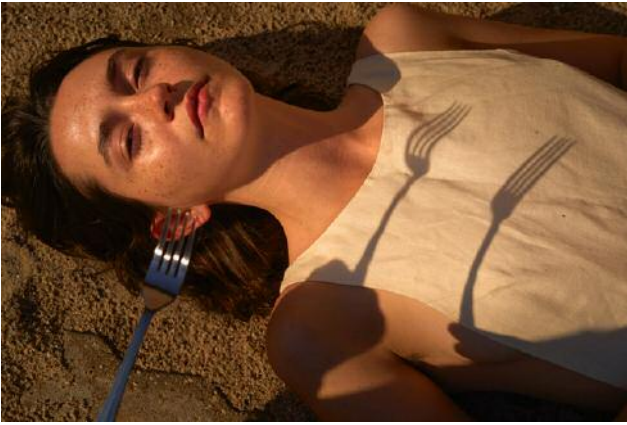
07_